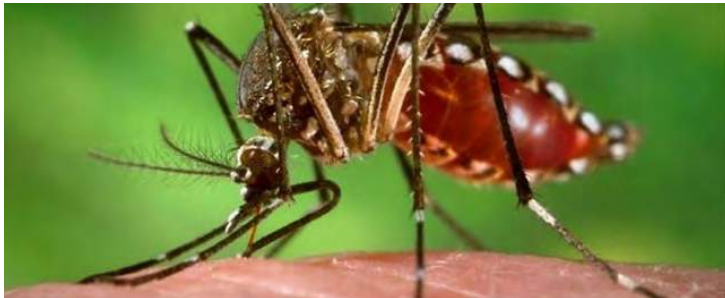
The Aedes Aegypti Mosquito.

The Office of the Chief Medical Officer was earlier this week informed by the Caribbean Public Health Agency (CARPHA) of the confirmation of two additional cases of Zika Virus Disease in Saint Lucia.