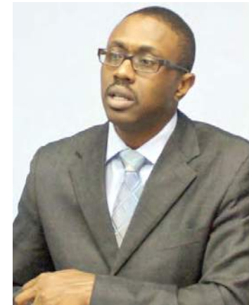
Tourism Minister Lorne Theophilus

According to the Tourism Minister, while any virus or disease is something that all Saint Lucians and all people should be concerned about, they should be comforted by the fact that the