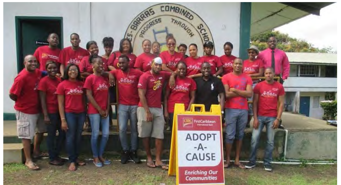
Bank staff outside the school during their voluntary effort that improved the school and its surroundings

with new and interesting stories. "We carpeted the school's library with new floor mats from wall to wall in hopes of creating a more comfortable environment for the children to read, and also brightened up the school's exterior with a fresh coat of paint," she added. This is the first time the bank's Adopt-A-Cause programme has included the Des Barras Primary School. Other schools that have benefitted in the past include Augier Combined School, Babanneau Secondary School, Bocage Combined School, Fond St. Jacques Primary School, Grande Riviere Infant and Primary Schools, La Croix Maingot Combined School, Salvation Army Preschool and Day Care, Soufriere Infant School and Vide Boutielle Primary School.