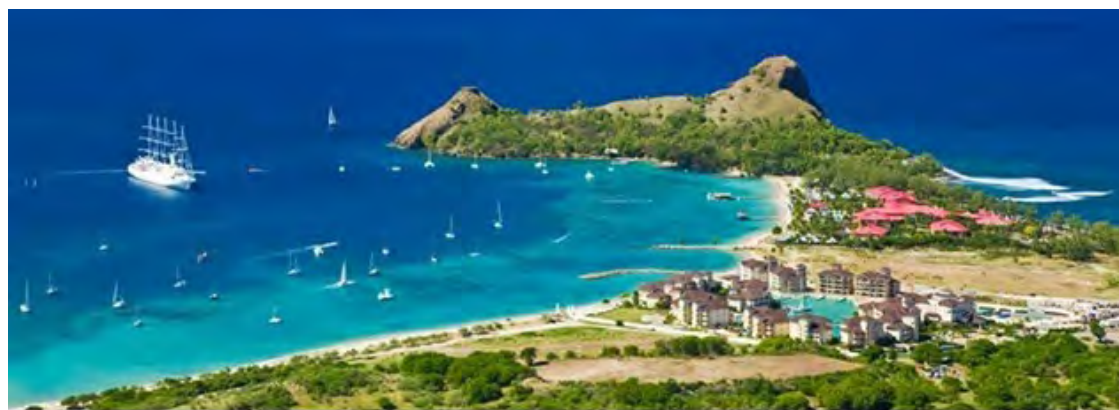
Pigeon Island, Saint Lucia is very popular with French visitor to the island

The Saint Lucia Tourist Board's Paris office organized a workshop in the Paris Opera building on March 22 in France.