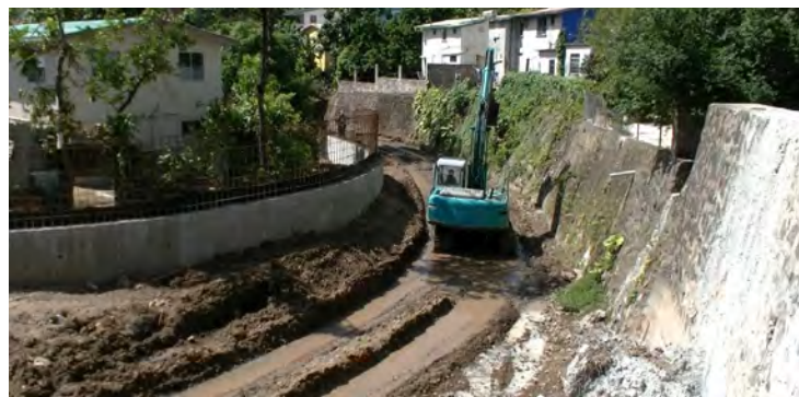
Earlier slope stabilization works at Entrepot are also linked to plans to build a wall stretching from the Entrepot Bridge to the Marchand Bridge.