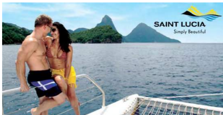
The Saint Lucia Tourist Board will roll out a series of marketing activities to promote weddings and honeymoons on the island.

Six hotels and event sponsors, Caribtours and You and