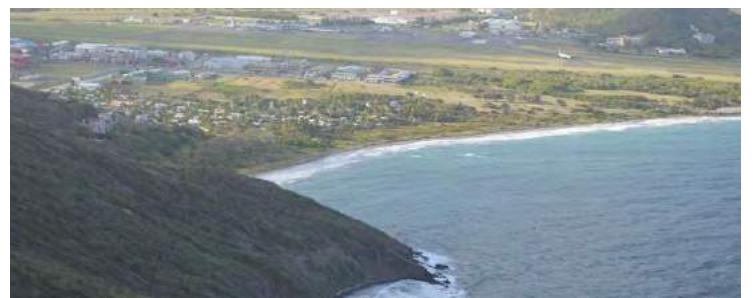
The consultation presented a summary of findings per sector on climate change vulnerability and adaptation.

The stakeholders included the agriculture sector (including livestock and crop farmers, fisher folk as well as technical and extension officers of the Ministry of Agriculture, Food Production, Fisheries, Cooperatives and Rural Development); the water sector (including stakeholders from the Water and Sewerage Company, the National Utility Regulatory Commission, the Water Resource Management Agency, the Forestry Division