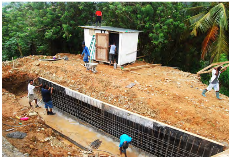
Works are well under way at the WASCO projects in Micoud, alongside several others taking place around the island.

It includes construction of a clarifier, filter and renovation