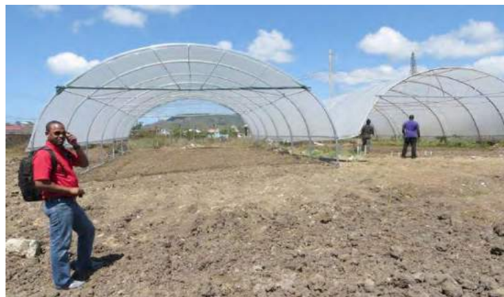
The species of trees are comprised of a variety of 25 fruit-bearing plants that are grown in St. Lucia, including cocoa, coffee, sour sop, sugar apple, and citrus.