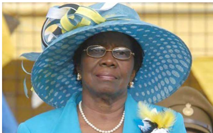
The committee was founded in December 2014 for the purpose of preserving and celebrating the contributions of Saint Lucia's longest serving Governor-General.

"She has contributed to the field of education, she has contributed to many important national events, for example, the Jounen Kwéyòl, which is famously known throughout Saint Lucia, everyone is looking forward to October and that event, the Nobel Laureate Week in February... her finger-