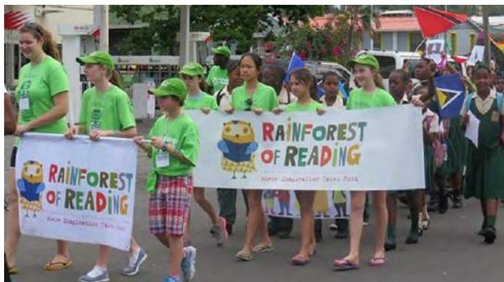
The Rainforest of Reading Festival is designed to eradicate illiteracy among primary school students.