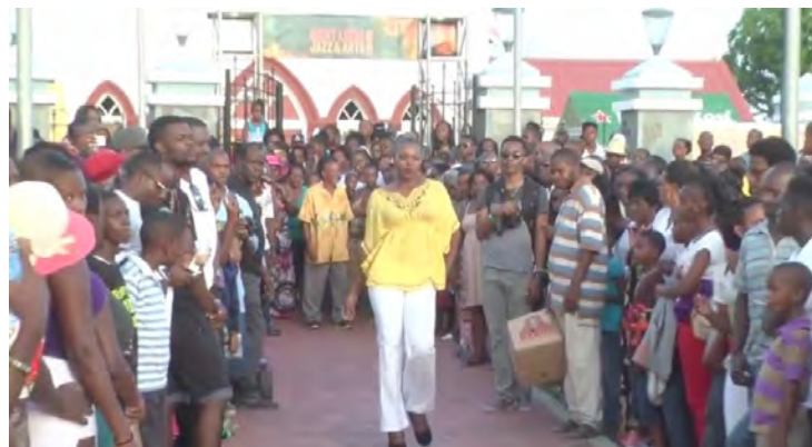
Sneak Peek: Street Theatre will bring these and many other catwalk thrills to Vieux Fort next Saturday.

able group for the development of arts and culture in Vieux Fort by ensuring that Vieux-Fort is featured in the national calen-