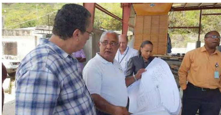
Prime Minister Dr. Kenny D. Anthony (left) recently visited the Caribbean Grains Flour Mill currently under construction at the Vieux Fort seaport.

Prime Minister and Parliamentary Representative for Vieux Fort South, Hon. Dr. Kenny D. Anthony has welcomed a new investment into the town of Vieux Fort.