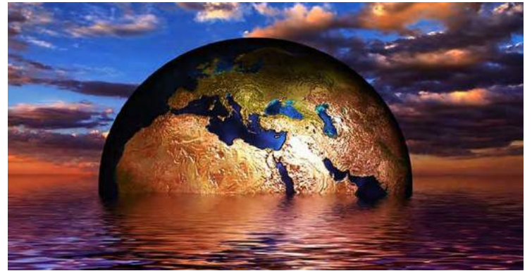
The Paris Agreement will legally come into force when at least 55 countries representing 55% of global emissions ratify it.

In addition to representing Saint Lucia at the High Level Signing Ceremony for the Paris Agreement, Hon. Dr. James Fletcher has been invited to participate in the High Level Thematic Debate on Achieving the Sustainable Development Goals, which will take place at UN Headquarters on Thursday 21st April, 2016.